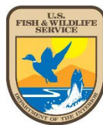
U.S. Fish and Wildlife Service (USFWS or FWS)